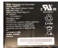
Large Internal batteries (Specific part numbers for new ET51/ ET56. Please see Page 9)