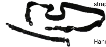
Breakaway shoulder strap